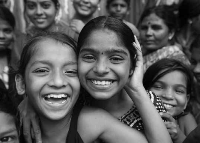
■ India is less happy than Pakistan and Palestine, says World Happiness Report. What's going on?

like. The US is ranked 15, followed by UK (21), Singapore (24), Saudi Arabia (35), Japan (46) and China (84), whereas Afghanistan and war-torn Syria joined eight sub-Saharan countries in Africa (Togo, Burundi, Benin, Rwanda, Burkina Faso, Ivory Coast, Guinea and Chad) are the 10 least happy countries ( The Hindu , 24 April 2015)