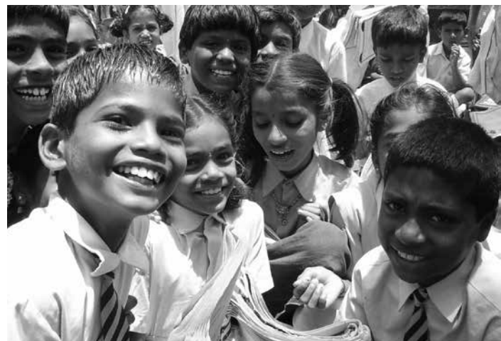
■ Already rated an unhappy place in 2014 with a ranking of 111, the country dropped six places to 117 out of 158 countries ranked in the 2015 list

The index reveals that, on the one hand, most of the countries have revised the yardstick for measuring the health of a nation by its wealth and have gone for a more human notion of being well and happy. On the other hand, India is still struggling with the outdated notion of amassing wealth for happiness, by hook or by crook, and, no wonder, it has not yet come to the track of integral happiness and wellbeing. As a matter of fact, wealth-based happiness is on a shaky foundation, like a house being built on sand, and it fluctuates according to the volume of wealth coming in and going out. As a country with nearly one-third of its population living below poverty line, the acute value of money in India, especially in that section, is more than understandable. The craze for money in the fairly well-off middle class and the affluent upper middle class is highly inclined towards upward mobility. Even the billionaires, who form the creamy layer of the Indian society, seem to be not satisfied with the unimaginable volume of wealth they possess. Such an irony gives a clear clue that Indians badly require realizing that even large credits of wealth fails them in life. Therefore,