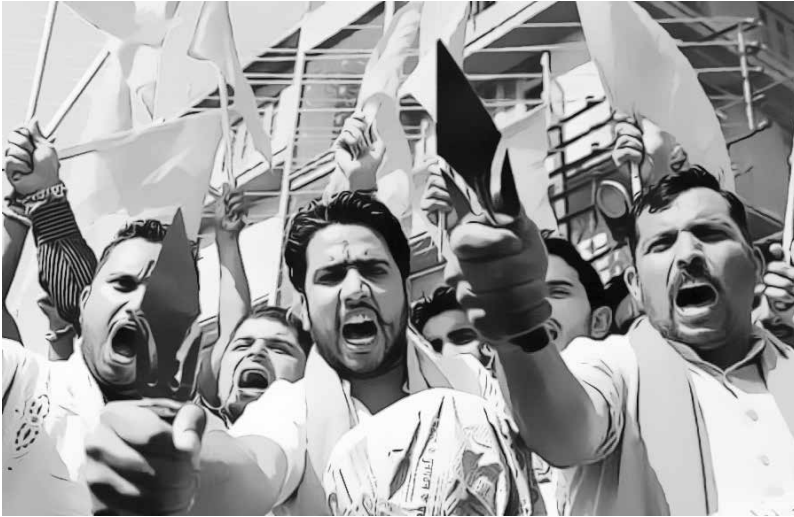
By mixing religion with Politics, India is going down Pakistan's road

there is a sense of time, even in universities and high offices. The number of lies being spoken in daily lives, even in public places, to the extent of breaking the world records, would shock anyone. The huge hand-outs of gold, silver and cash at temples and other places of worship often expose the disturbed conscience due to corrupt earnings as well as the human greed to grab more from God. The risky pilgrimages, the worrisome fasts and the expensive rituals do not seem to trigger off any change of heart in the so called believers. What's more, the high per cent of discrimination on the basis of gender, caste, region, religion, language, ideology, food habits, dress patterns and social conventions, along with the alarming gap between the rich and the poor as well as the mainstream and the margins smacks of a Himalayan bankruptcy of the real result of faith. If this is mostly the picture of the religious country, no doubt, it has to be concluded that the above expressions of blind faith is hardly of any avail for the bright future of this country.