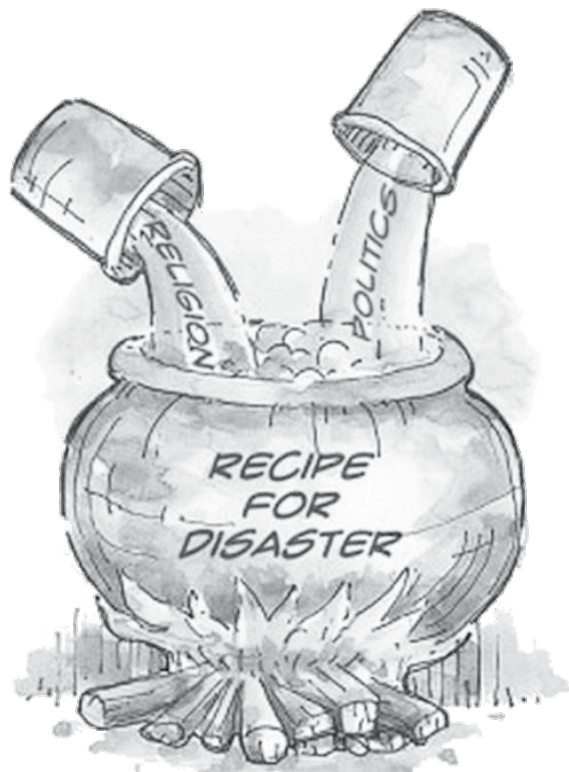
■ Religion based Politics! : A complete Disaster

The two major sectors that largely blind, enslave and munch through most of the ‘faith-full’ Indians are religion and politics. Both areas